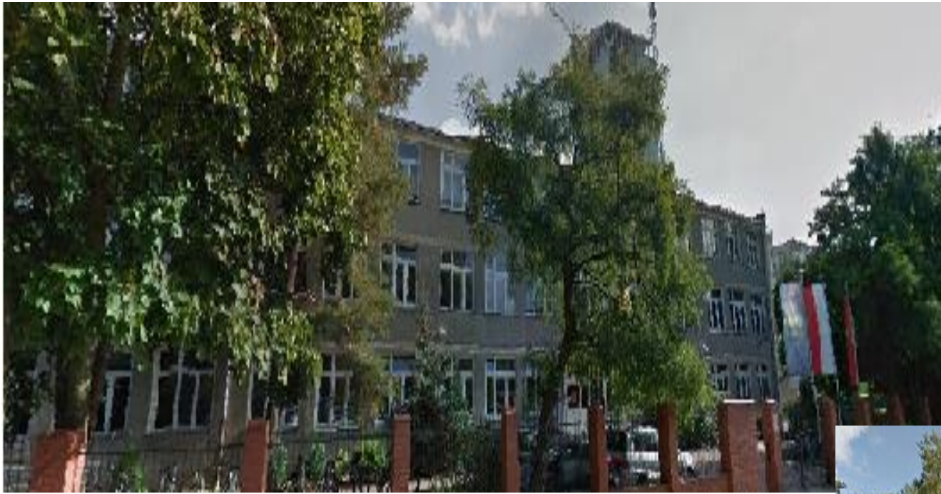
Here is the main entrance and the main building